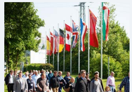
International trade fair > picture download