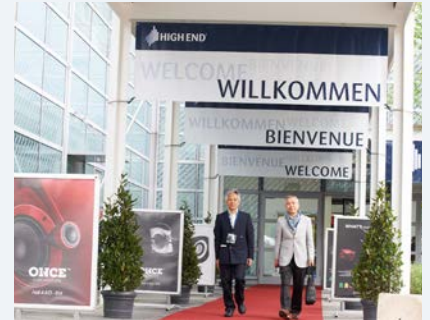
Entrance MOC > picture download

“This means that the HIGH END offers not only a broad spectrum, but also an international selection, thereby serving as a shop window for the innovative drive of the whole industry. This is the basis for the ever growing international significance of the HIGH END and the recognition it receives on the basis of its quality. We are delighted with the faith that exhibitors put in our event through their participation”, stresses Kurt Hecker, Chief Executive of HIGH END SOCIETY e.V.